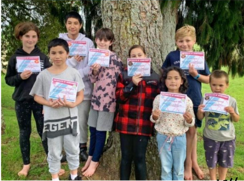
Congratulations to all our certificate recipients! Tau kē!!